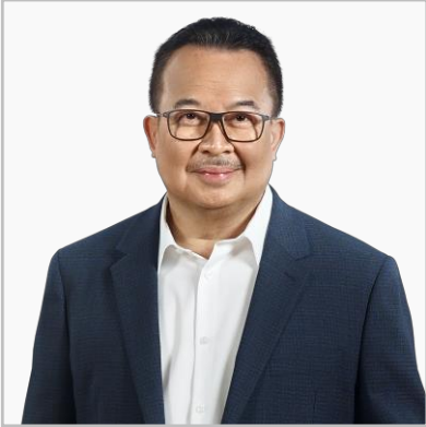
RHENALD KASALI President Commissioner/ Independent Commissioner